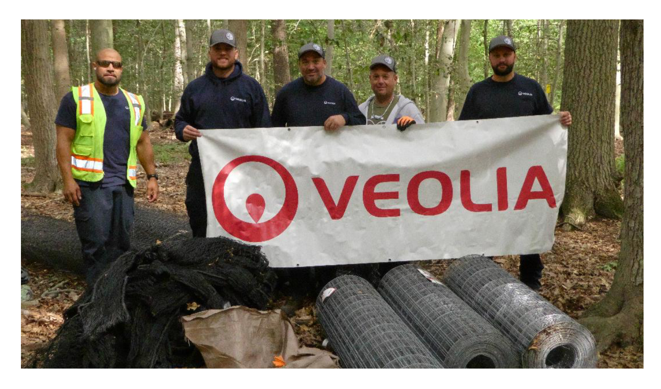
Veolia Water's vital financial and logistical support is crucial to Closter Nature Center's reforestation efforts.

In addition to financial support, Veolia has also provided some logistical help. On Friday, September 22<sup>nd</sup>, a work crew from Veolia helped CNC with the strenuous task of removing old fencing in preparation for installation of more effective deer exclusion fencing later this fall.